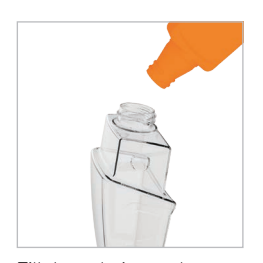
Fill the solution tank with the Vax carpet cleaning solution.