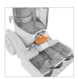
Open the hose connection port cover.

Suitable for use on upholstery and carpeted stairs. Perfect for reaching into crevices.