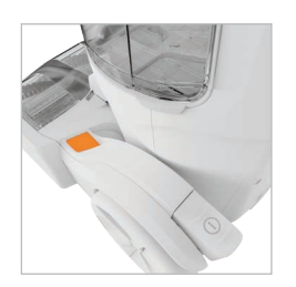
The mode indicator will illuminate WASH on the forward stroke.